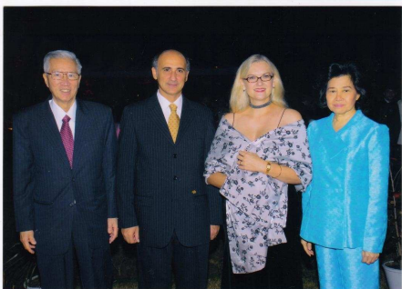
With the Ambassador of Turkey and spouse during their National Day reception