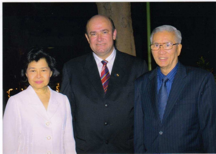
With the Ambassador of Hungary during their National Day reception.