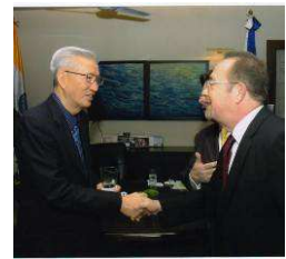
(Left to right) With the Ambassador of Oman, the Ambassadors of Lesotho & Lebanon, and with the Ambassador of Ecuador