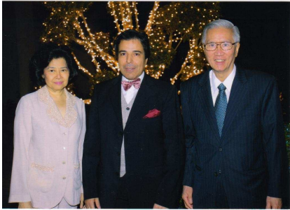
With the Ambassador of Algeria during their National Day reception.