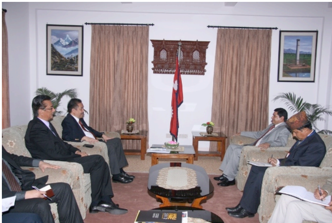
Amb. Allarey, Honorary Consul General Vaidya meeting with Deputy Prime Minister and Minister of Foreign Affairs Shrestha (2 nd from right).